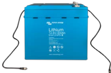
12,8V 300Ah LiFePO4 Battery

With Bluetooth cell voltages, temperature and alarm status can be monitored. Very useful to localize a (potential) problem, such as cell imbalance.