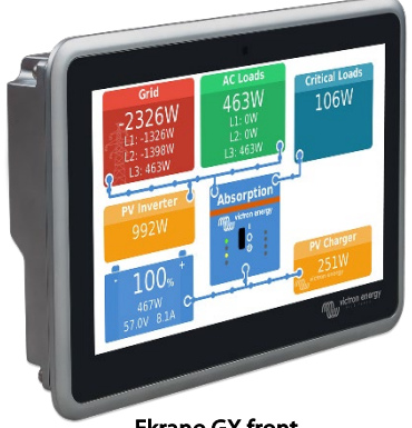
Ekrano GX front and back