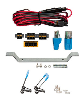
Accessories included with the Ekrano GX