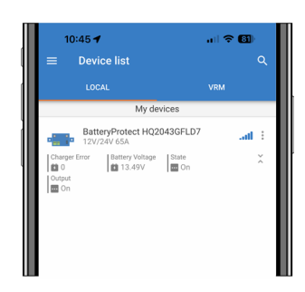
Instant Readout via VictronConnect