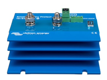
Smart BatteryProtect BP-220